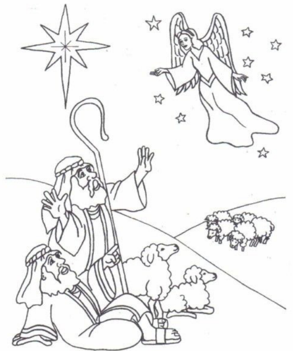
The Angel Telling the Shepherds the Good News